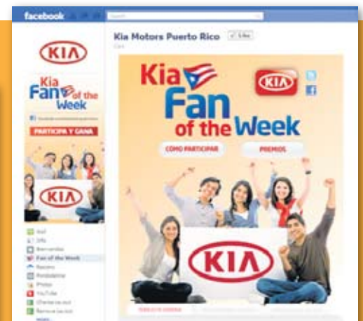
FACEBOOK Business page design and campaign management