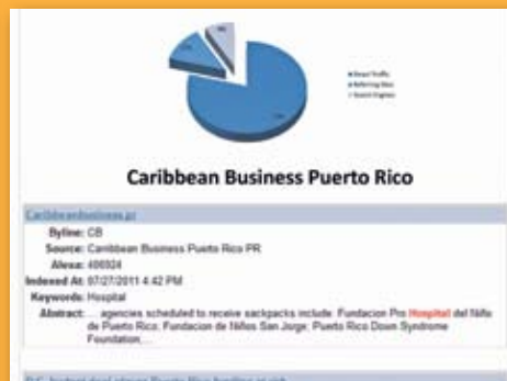
POMM Professional Online Media Monitoring