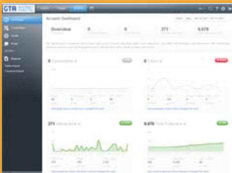
SMMD Social Media Marketing Dashboard

Integration, Engagement, Analytics and Crisis Management are some of GTA's fortes.